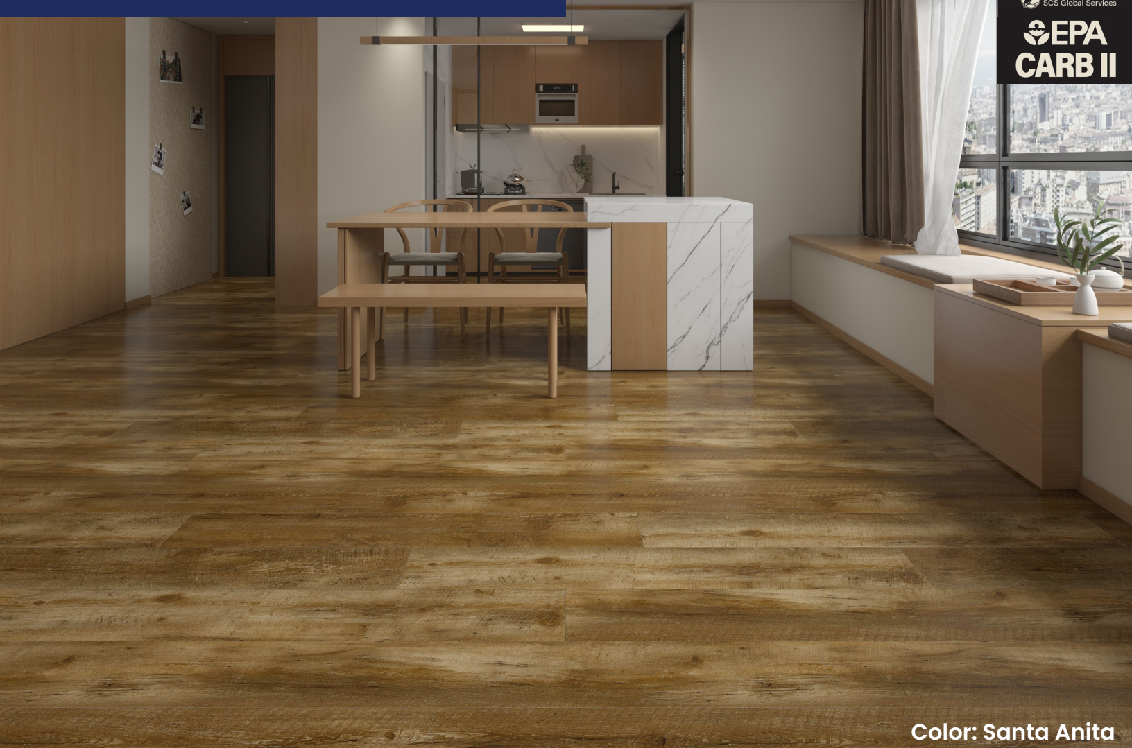
Color: Santa Anita